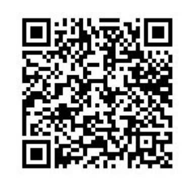
BDJH Counseling Website